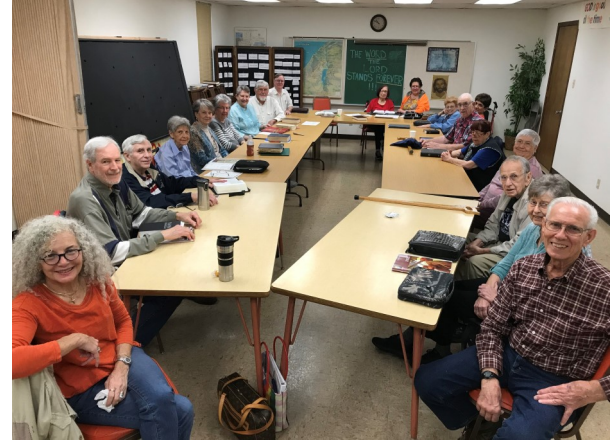
Thursday Morning Bible Study