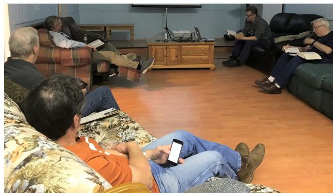
Men's Discipleship Study