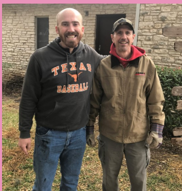
Happy New Year 2020

Just a reminder that we often take photos, and at times, video, of ministry events to put up around Church on the screen on Sundays and to post to the web that publicizes the worship, service, fellowship, and education life of Christ Lutheran.