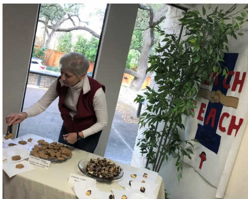
Late Service Fellowship Refreshments