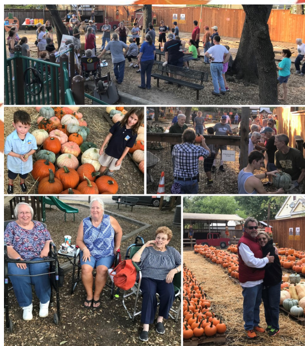
Pumpkin Patch Unloading & Opening Day!