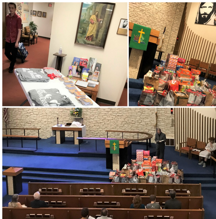
Bread for All Food Drive