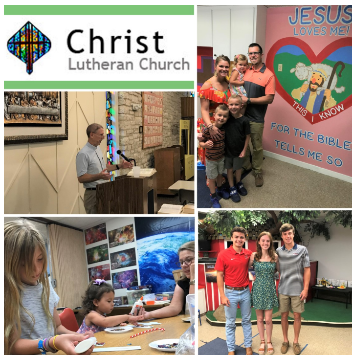
Sundays at Christ