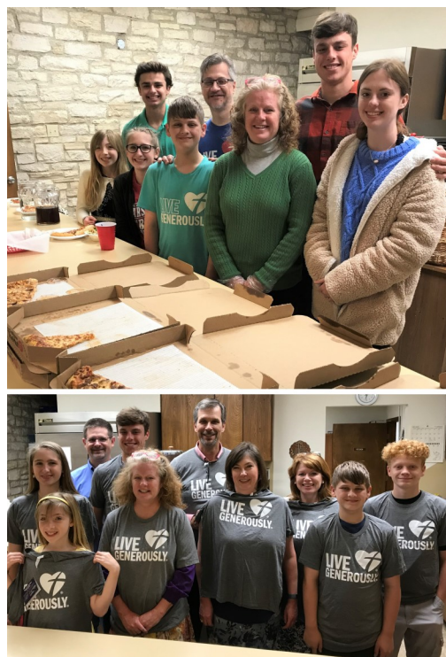
Thrivent Action Teams and Voter's Meeting