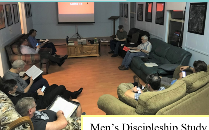
Men's Discipleship Study

Marbridge- We are making plans to volunteer again at The Ranch (assisted living) of Marbridge ( www.marbridge.org ) on Saturday, April 6th from 9:45 - 11:15am, to lead/help with arts and crafts, and to have games available too. Marbridge is located at 2310 Bliss Spillar Road, Manchaca, TX 78652. Please contact Jordan for information, and to sign up to serve.